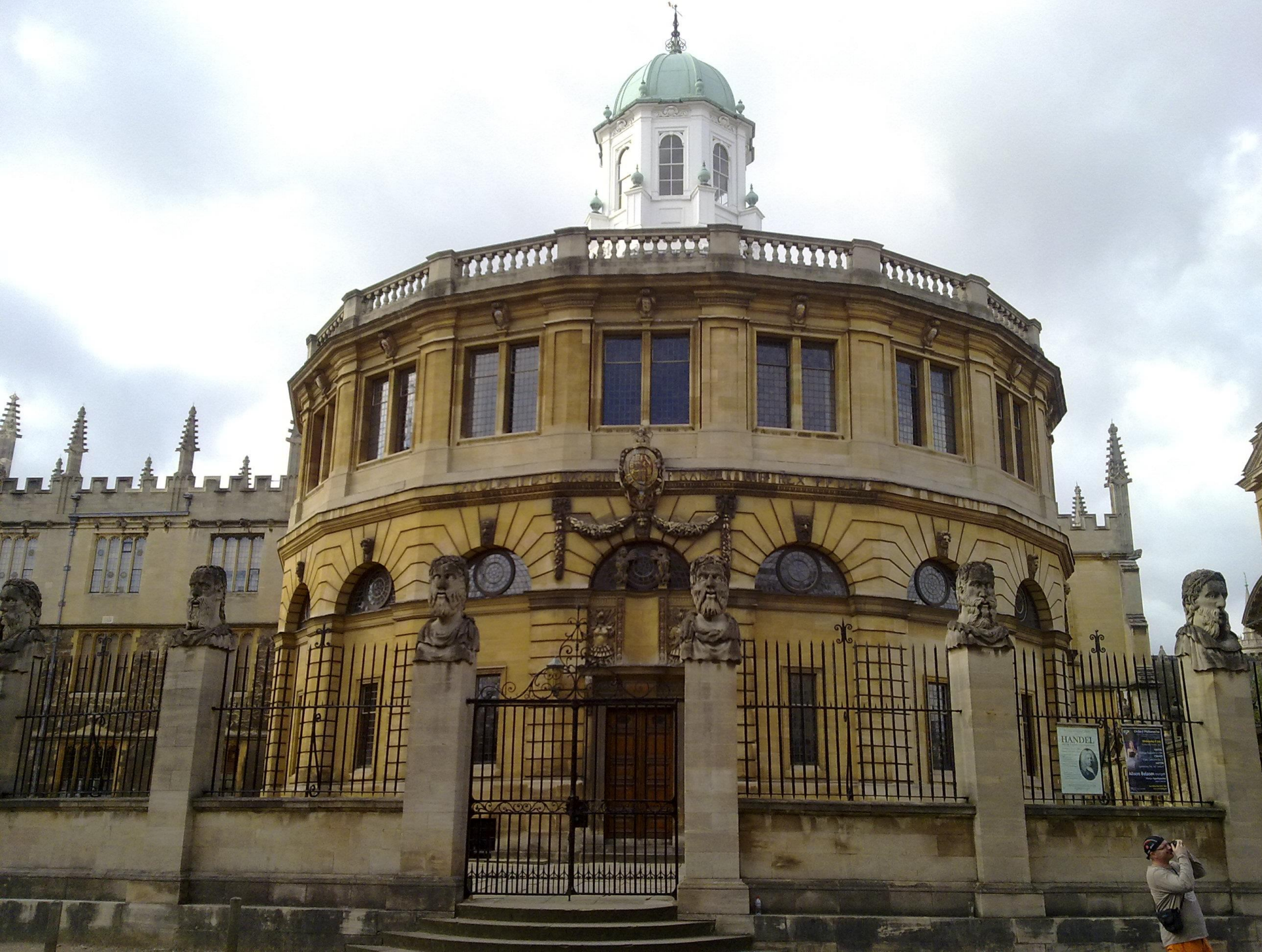
Oxford (UK), Broad Street, Sheldonian Theatre