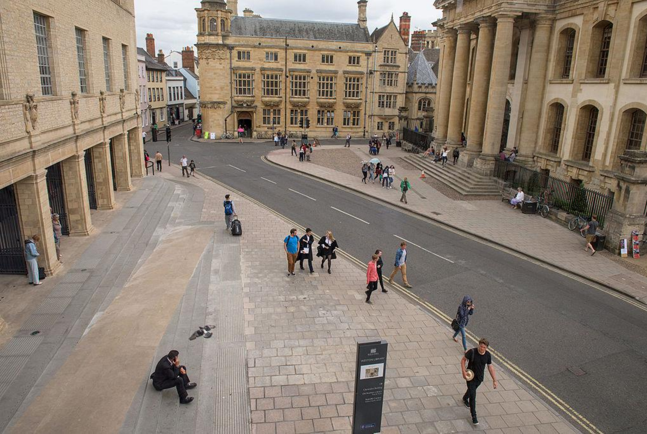
Oxford (UK), view of the East end of Broad Street, with the Weston Library on the left, Oxford Martin School (Indian Institute) straight ahead, and the Bodleian Libraries' Clarendon Building on the right