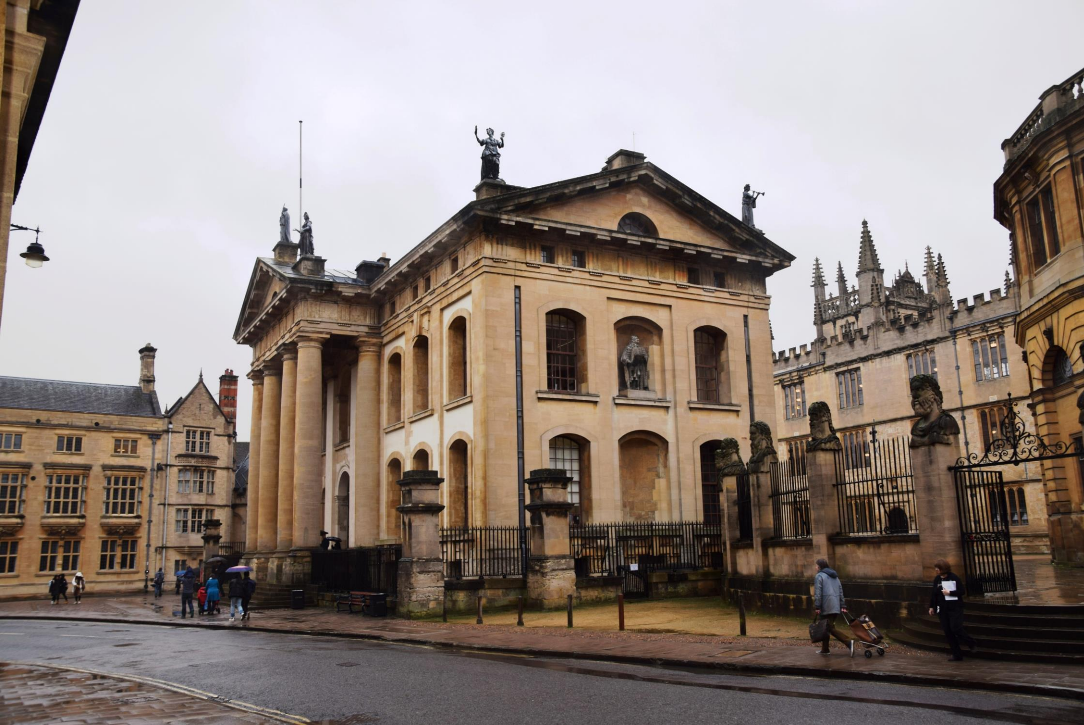
Oxford (UK), Broad Street, looking towards the Clarendon Building