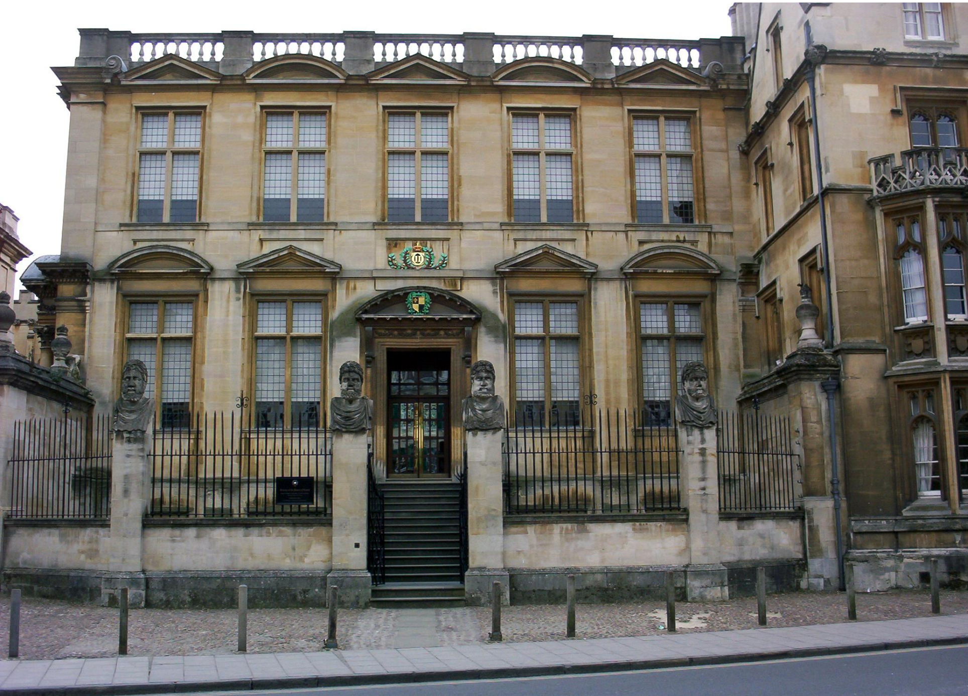
Oxford (UK), Broad Street, the History of Science Museum