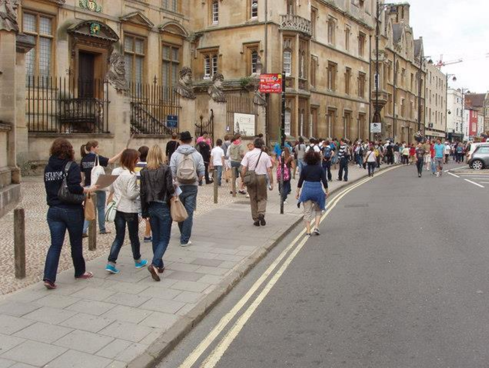
Oxford (UK), Broad Street, the History of Science Museum