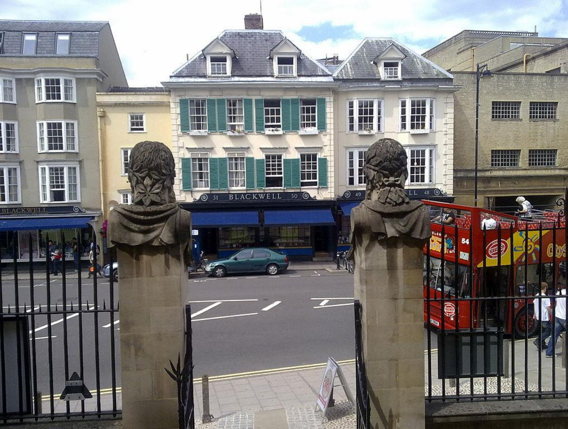
Oxford (UK), Broad Street, Blackwells as viewed from the History of Science Museum opposite on Broad Street