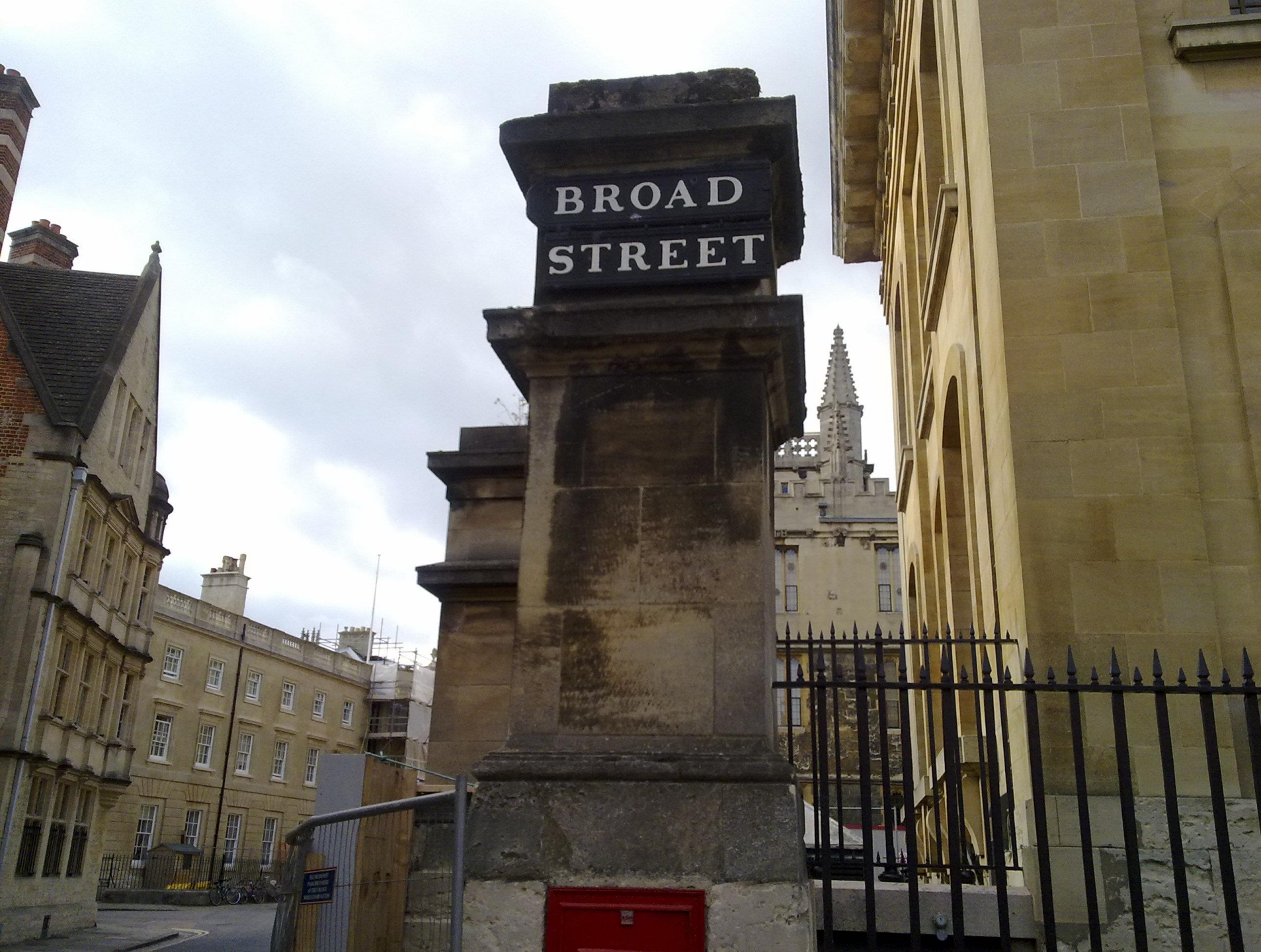
Oxford (UK), the entrance to Broad Street, at Catte Street (east) end, looking towards Radcliffe Square