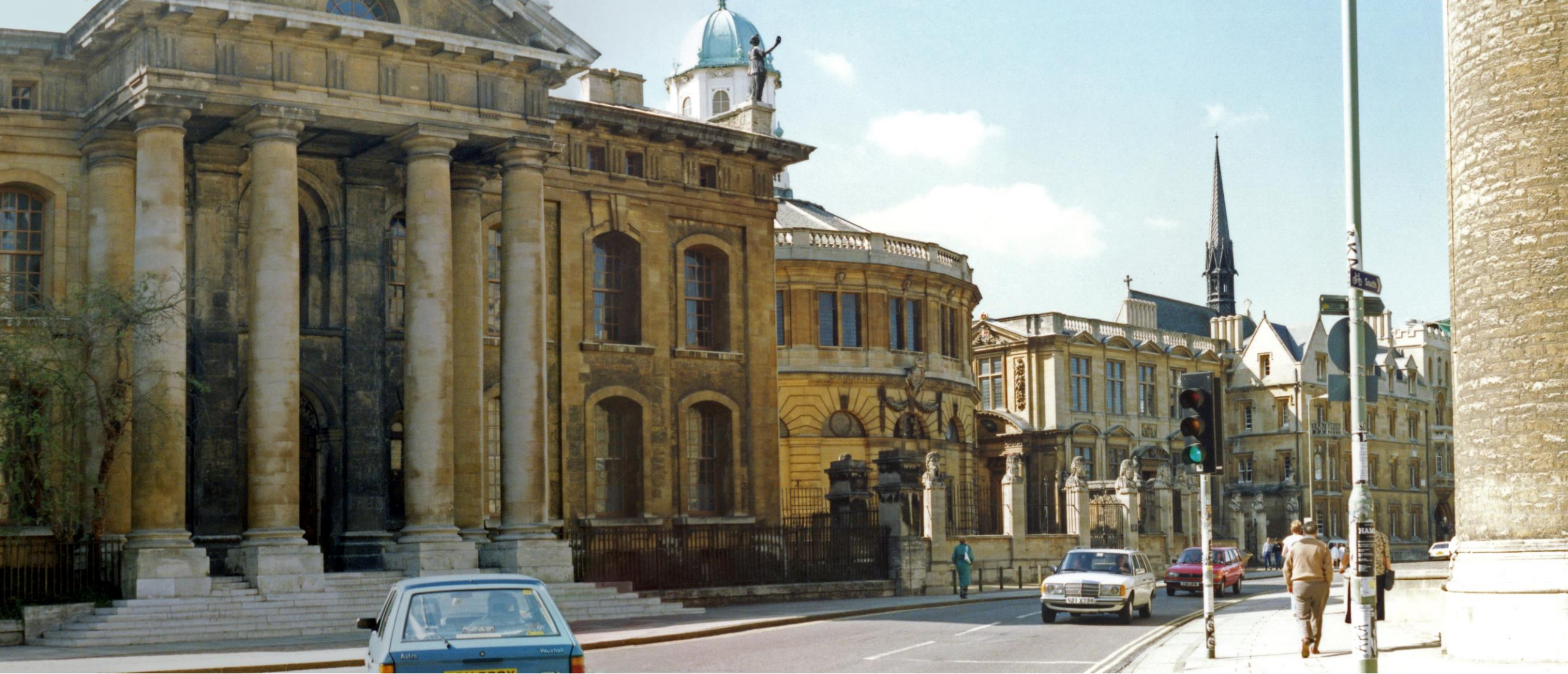
Oxford (UK), Broad Street, looking towards the Clarendon Building and Sheldonian Theatre