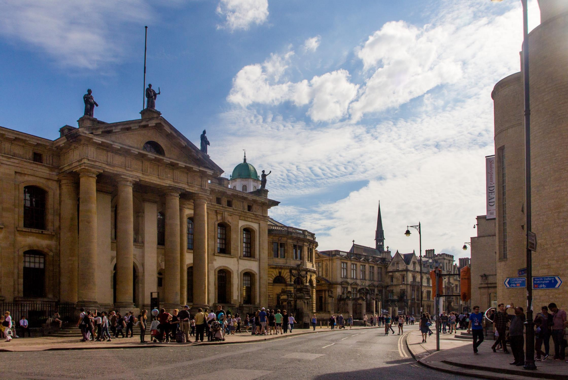
Oxford (UK), Broad Street, showing the Clarendon Building, Sheldonian Theatre and the History of Science Museum