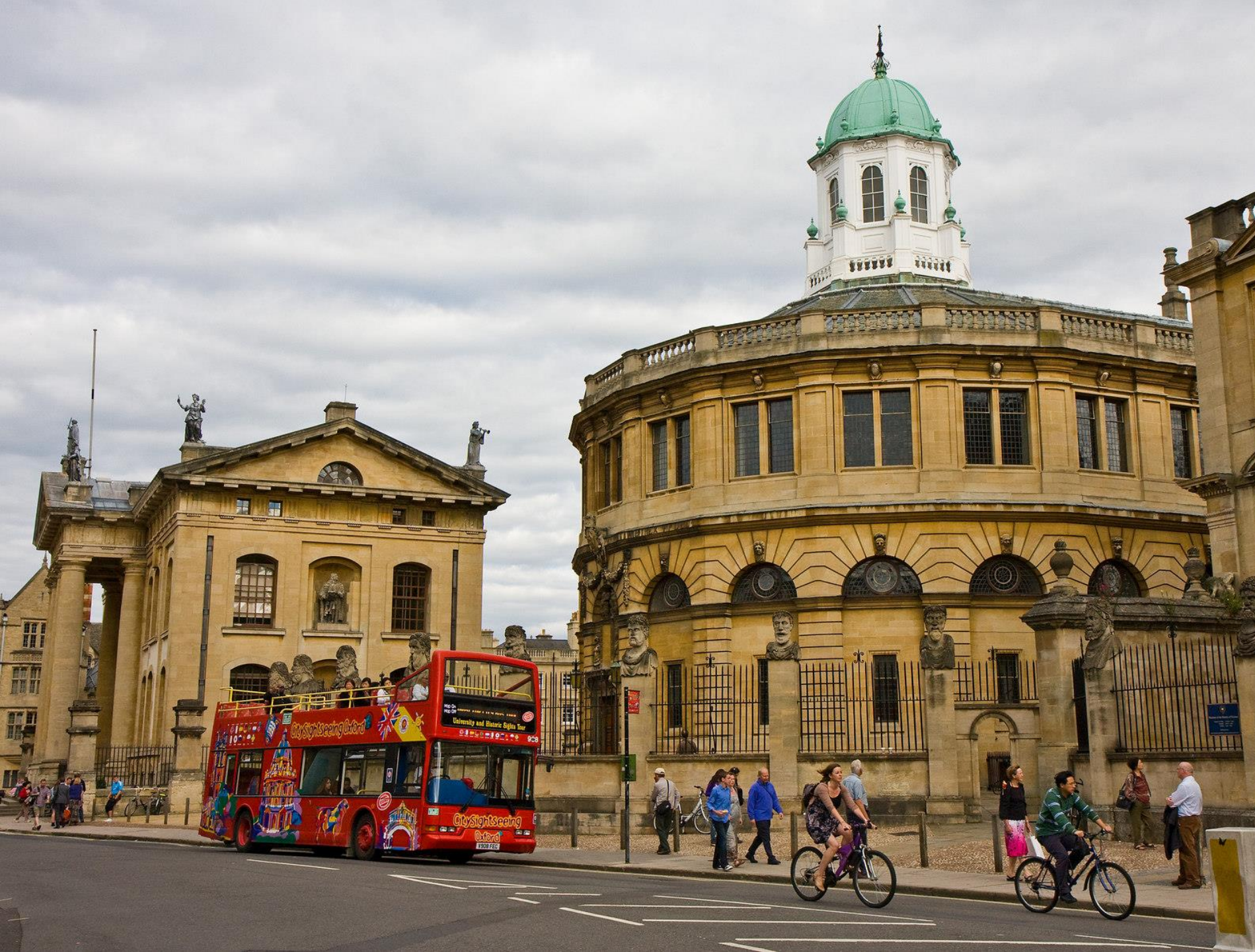
Oxford (UK), Broad Street, looking towards the Sheldonian Theatre, Clarendon Building in the background