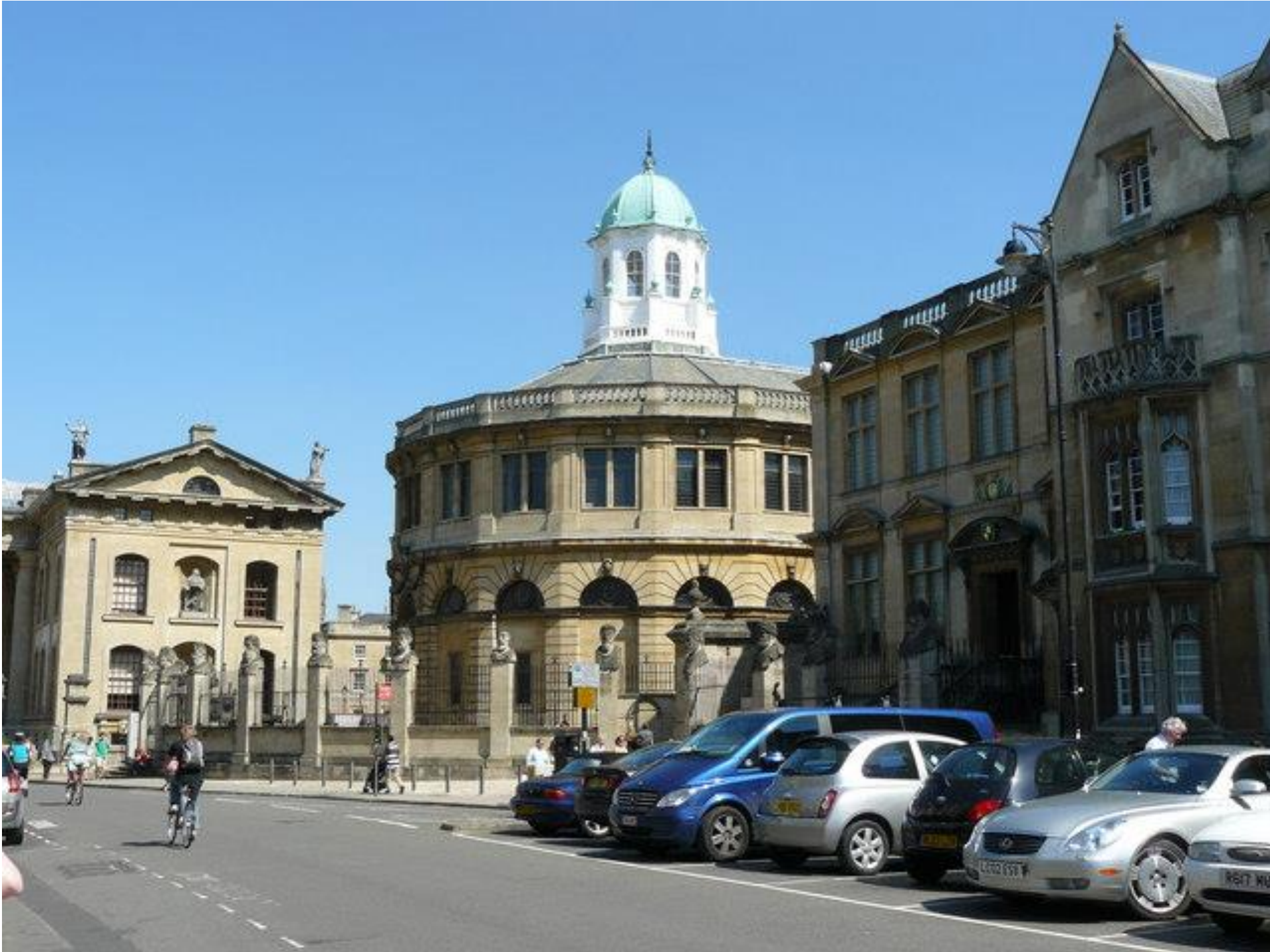
Oxford (UK), Broad Street, looking towards the Sheldonian Theatre and the History of Science Museum